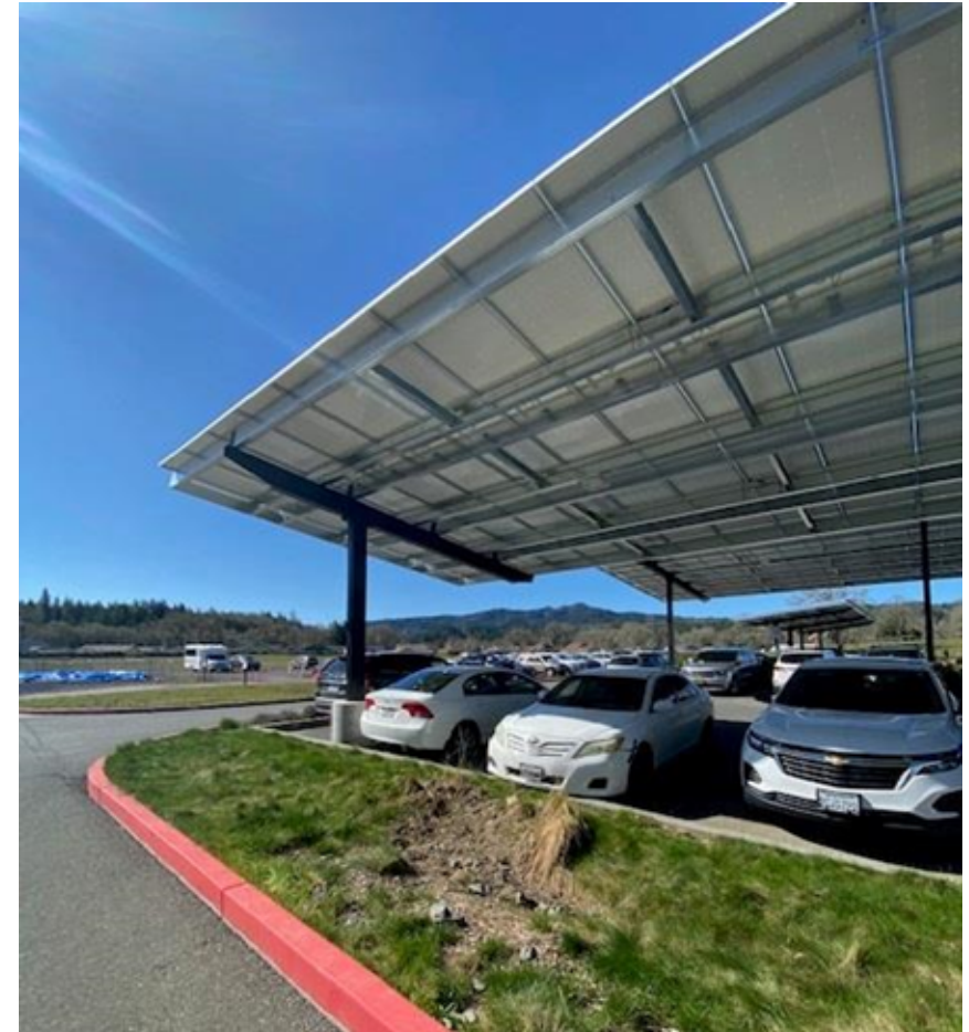
Solar PV at Adventist Health Howard Memorial Hospital. Willits, CA.